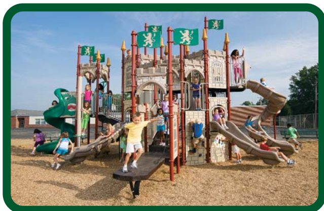
At Linntown Intermediate School "Imagination is King" with a Castle Themed Playground that Playworld Systems installed last year.

Recently, Playworld Systems, Inc. donated playground equipment at both Kelly Elementary and Linntown Intermediate schools. LASD is very grateful for this very generous donation and encourages other local businesses to consider helping our students.